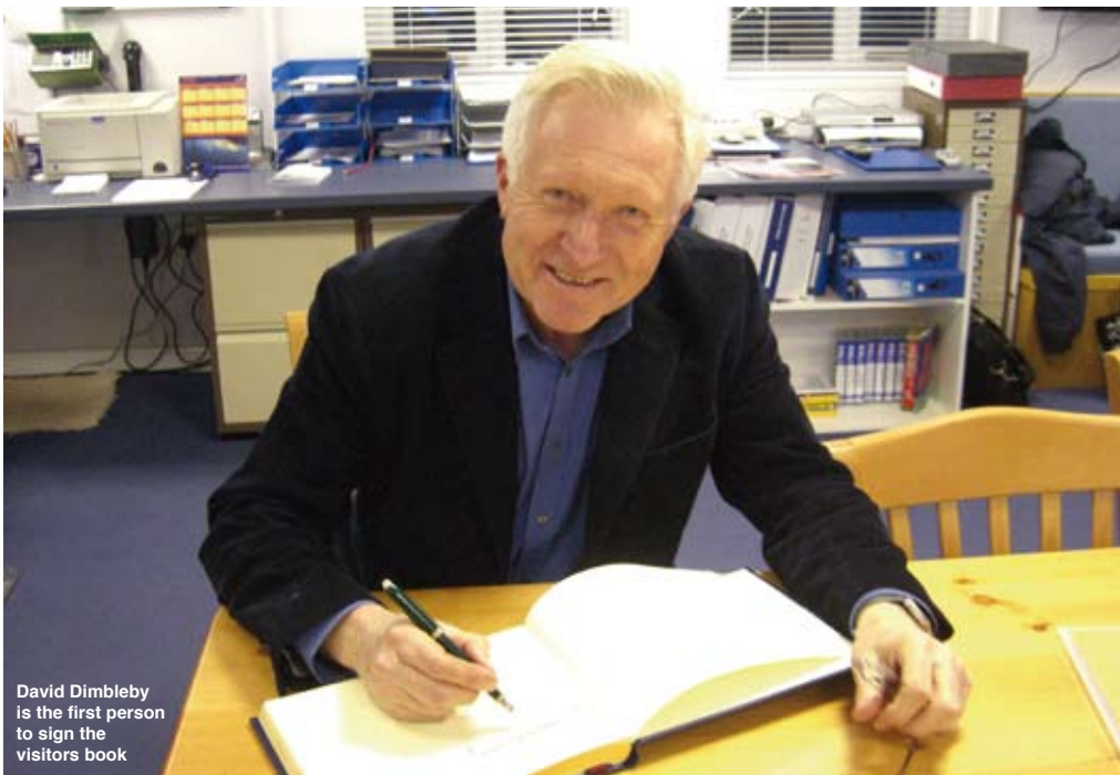
David Dimbleby is the first person to sign the visitors book