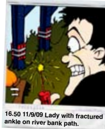
16.50 11/9/09 Lady with fractured ankle on river bank path.

Cartoons by James Fenton jamesfenton@blueyonder.co.uk