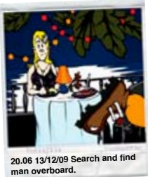
20.06 13/12/09 Search and find man overboard.

(Originally printed in Lifeboat Magazine)