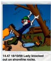
14.47 18/10/09 Lady knocked out on shoreline rocks.

The SMS alerts are triggered by the crew pager system so, shortly after they get the call, you do too. However, unlike our volunteer crews, you can choose what time of day you would like to receive alerts and set a limit on how many messages you receive. You can also pause the service for a while, for example if you are going abroad on holiday. To sign up visit www.rnli.org.uk/sms-launch-alerts