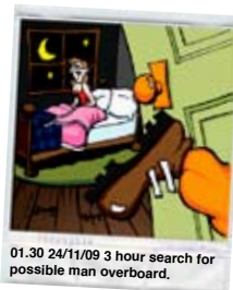
01.30 24/11/09 3 hour search for possible man overboard.

Details of the Dart lifeboat launches are usually available on the local web site shortly after the boat returns or, in the case of a prolonged call out, whilst it is in progress.