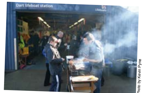
Trust me. I'm a Mechanic.